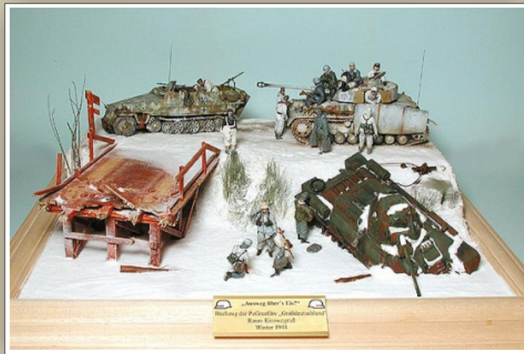
The author's diorama entitled " Kirovograd '44 " snowed in using the techniques described in this article.

"Grannies prescription" for modeling realistic snow on your dioramas.